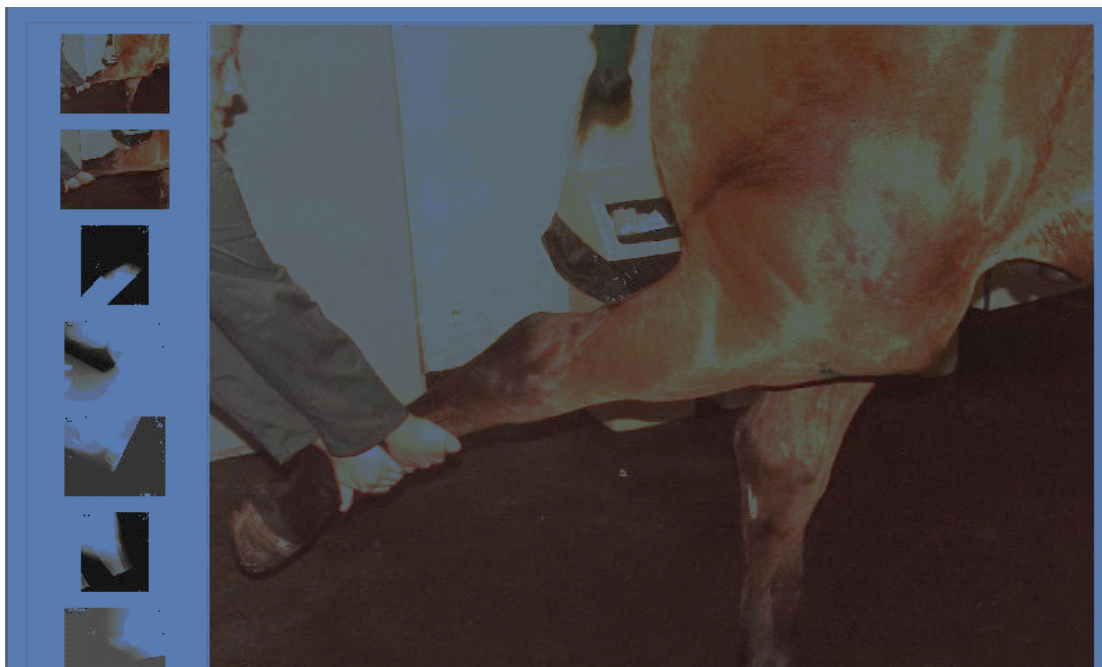
Figure 5. All the media about the case (pictures, videos, x-rays, scans) can be displayed.